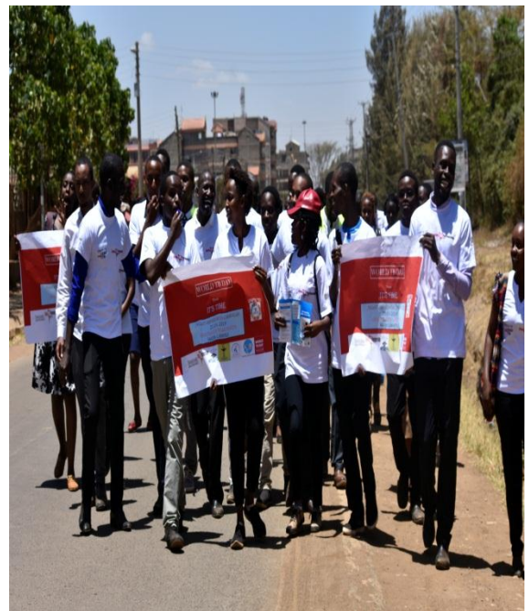
Tb Awareness walk