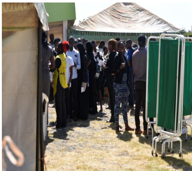
Participants and staff busy offering free medical services including Tb screening